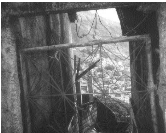
A view from within Rocinha Favela in Rio de Janeiro

There can be little doubt that Brazil continues to be plagued by serious rights abuses. Official recognition of the gravity of these problems is probably the greatest single human rights achievement of the outgoing Cardoso administration. But that is far from enough. hrd