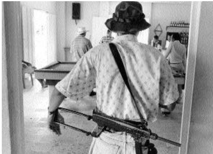
United States Defense Forces of Colombia paramilitaries control this village and patrol openly with automatic weapons, like in this pool hall.

The political climate in Colombia has compounded these difficulties. Government attempts to negotiate with both the FARC and the ELN ended bitterly this year. As the guerrillas, apparently unconcerned with their public image, increased their actions against the civilian population, mainstream Colombia became increasingly angry and frustrated. A majority of Colombians came to embrace a harder line, supporting a greater military role and reductions in civil liberties to restore law and order. Many came to view human rights groups—with their attempts to punish military excesses, their opposition to