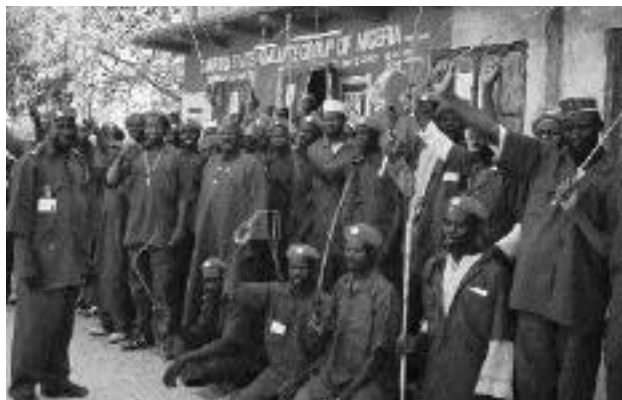
Bands of this volunteer army, known as the Zamfara State Vigilante Group, patrol the streets, arresting anyone suspected of committing offenses.

Many groups that promote racial discrimination, religious persecution, and state-sponsored violence operate under the guise of vigilantism. These groups not only offend sensibilities, but also violate every human rights treaty that Nigeria has ratified. One of the most enduring examples of these kinds of groups is the "Bakassi Boys," active in the three eastern states of Abia, Anambra, and Imo. They began as an initiative of traders in Aba, but were later hijacked by state governments, which added partisan political ends to their objectives and armed them with dangerous weapons (including firearms) without police checks. The Bakassi Boys make rou-