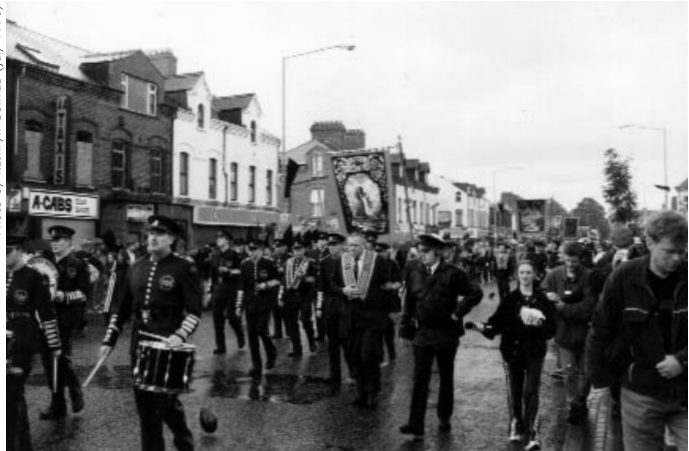
An Orange Order march, 1998

When the Belfast Agreement was negotiated in April 1998, political parties found that human rights issues provided a foundation for building a bridge between the opposing positions. While compromise on the central question of the constitutional status of Northern Ireland appeared impossible, underlying fears of domination and discrimination could be addressed by providing for human rights protections. Human rights standards provide a basis for separating legitimate negotiating demands (for example, equality) from illegitimate ones (for example, domination). Because they are universal and thus transcend the parties in conflict, human rights standards provide an important touchstone for what is just.