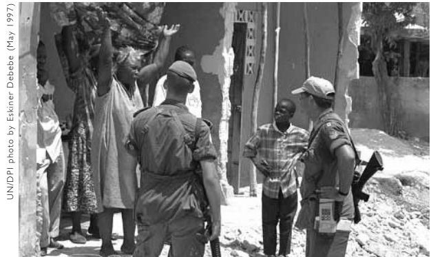
United Nations peacekeeping soldiers try to console a Port-au-Prince woman

TÜRK: There are practical obstacles to the mainstreaming of human rights into all UN activities. UN activities in the field of human rights are concentrated on norms and procedures and seldom reach all the relevant areas of policy