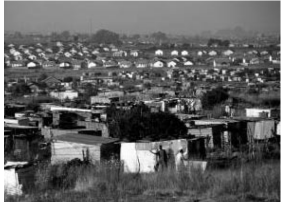
A squatter camp adjoins a middle class area on the outskirts of Soweto Township southwest of Johannesburg

Intervention was not easy. The local residents were reluctant to accept the idea that the conflict related to issues of rights. The South African residents did not talk in terms of rights: "rights" was a foreign notion to them. They talked about such issues as the lack of employment, infrastructure and housing, the police presence in the area, and how the "foreigners" might take their jobs. Emphasizing their own socioeconomic plight, they were not receptive to the notion that the "foreigners" had rights. Raising rights concerns in relation to this conflict revealed that xenophobia was a major underlying cause of tension. The South Africans vehemently rejected the idea that their actions were motivated even in part by xenophobia; in their view, the sole problem was the squatters' alleged criminal activities. The South Africans threatened to leave the mediation process if the issue of xenophobia was not dropped.