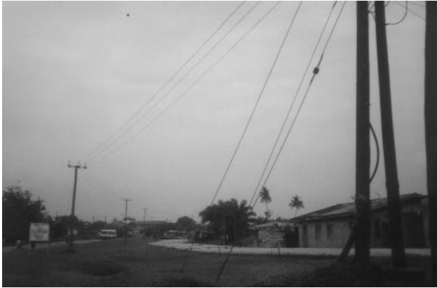
Ivana Vuco (June 2000)