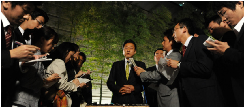
Prime Minister Yukio Hatoyama with reporters.